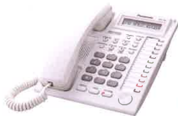
■ KX-T7730 LCD, Speakerphone Unit