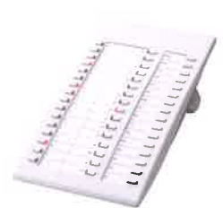
■ KX-T7740 DSS Console