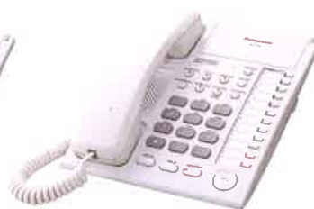
■ KX-T7750 Monitor Unit