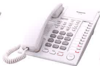
■ KX-T7720 Speakerphone Unit